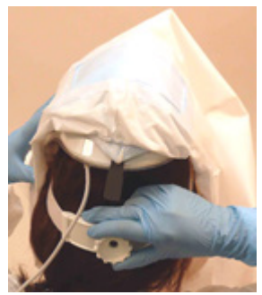
5. Secure Helmet by tightening Ratchet Knob as tight as comfortably possible, while ensuring stability.