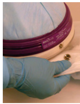
4. Snap front of Hood DLC to center Helmet snap