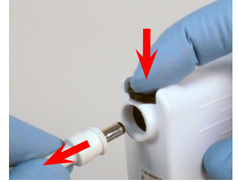
Disconnect the Helmet Power Cord from the Battery - Press down on the Secure Lock (Black) Button to release, then pull the cord connector out from the Battery connection receptacle.