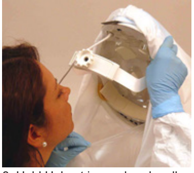
Hold Helmet in one hand; pull Cuff down with other hand, and place chin into Cuff.