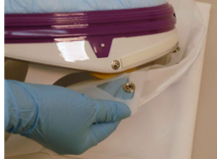
3. Snap one side of Hood DLC to one side snap of Helmet (DLC Cuff facing