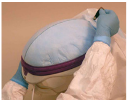
6. Grasp Hood Snap Tab and begin pulling hood up and over helmet.