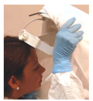
4. Pull Helmet over and down onto head.