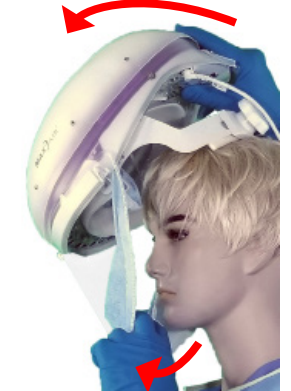
2. Pull the DLC2 Cuff away from the chin. Lift the Helmet up, forward, and off the head.