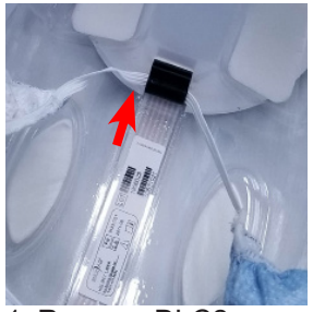
Remove DLC2 Attachment Band from the Helmet Band Clip.