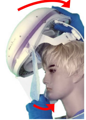
4. Hold Helmet by rear headband, pull front top edge of DLC2 Cuff down, place chin into DLC2 Cuff. Pull Helmet over and down on to head.