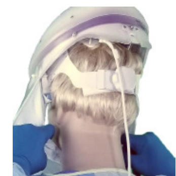
6. Slide fingers between Cuff and face from each temple down and under chin so Cuff is smoothly around and close to back of face and chin.