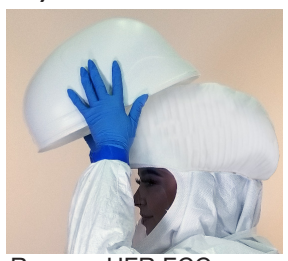
Remove HFR FCC completely and decon for next use.