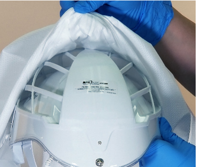
5. Continue pulling the Hood over the Helmet down to within about 1-2 inches from the top rear Helmet Snap.