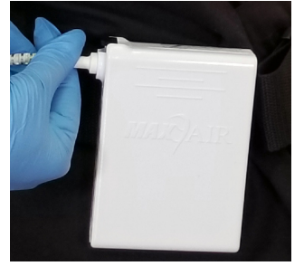
Cord to Battery. Push Power Cord Connector into Battery Receptacle until Secure Connection audibly clicks.