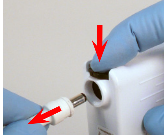
Disconnect the Helmet Power Cord from the Battery - Press down on the Secure Lock (Black) Button to release, then pull the cord connector out from the Battery connection receptacle.