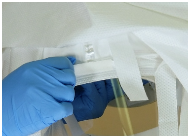
6. If the Hood Filter is folded over the 7. Connect Helmet Power front Velcro Strip, "flip" the fold up to expose the Velcro Strip. Pull the Hood down further in back to remove the wrinkles from the Hood Filter over the Helmet top.