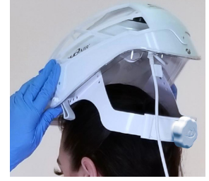
7. Lift Helmet up and off head.