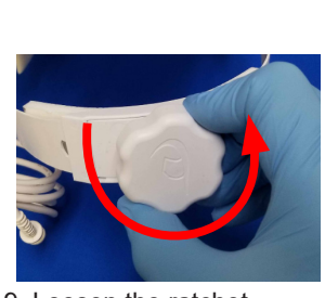
9. Loosen the ratchet adjustment knob counter-clockwise to ensure the Helmet will easily fit over the head.